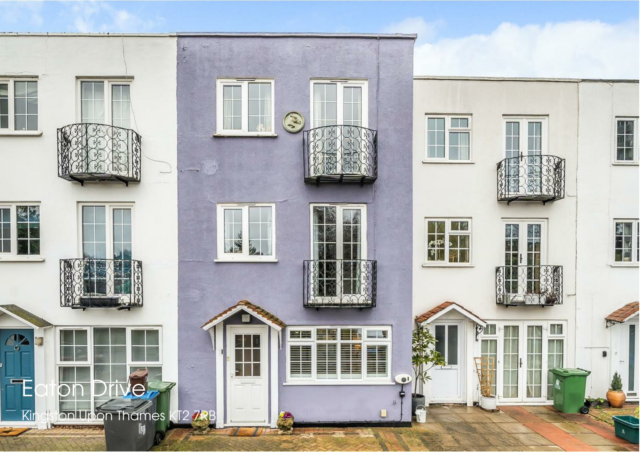
Eaton Drive Kingston Upon Thames KT2 7RB